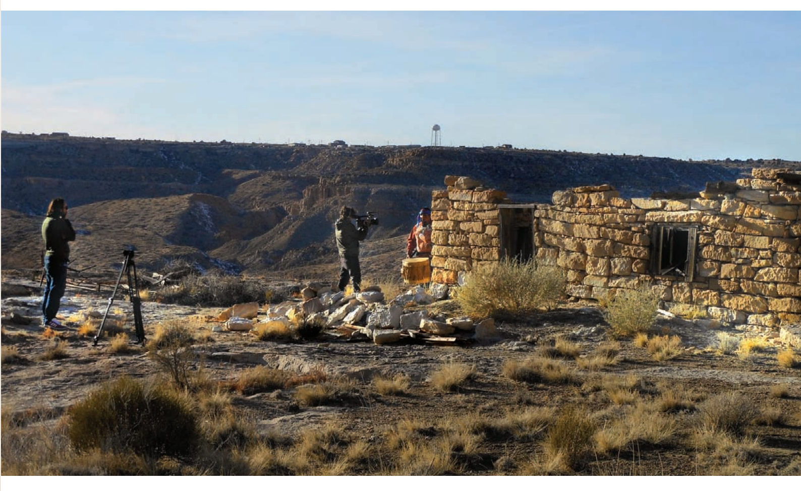
Carmelo Camilli and Thomas Torelli, shooting on location at the Hopi Reservation, USA