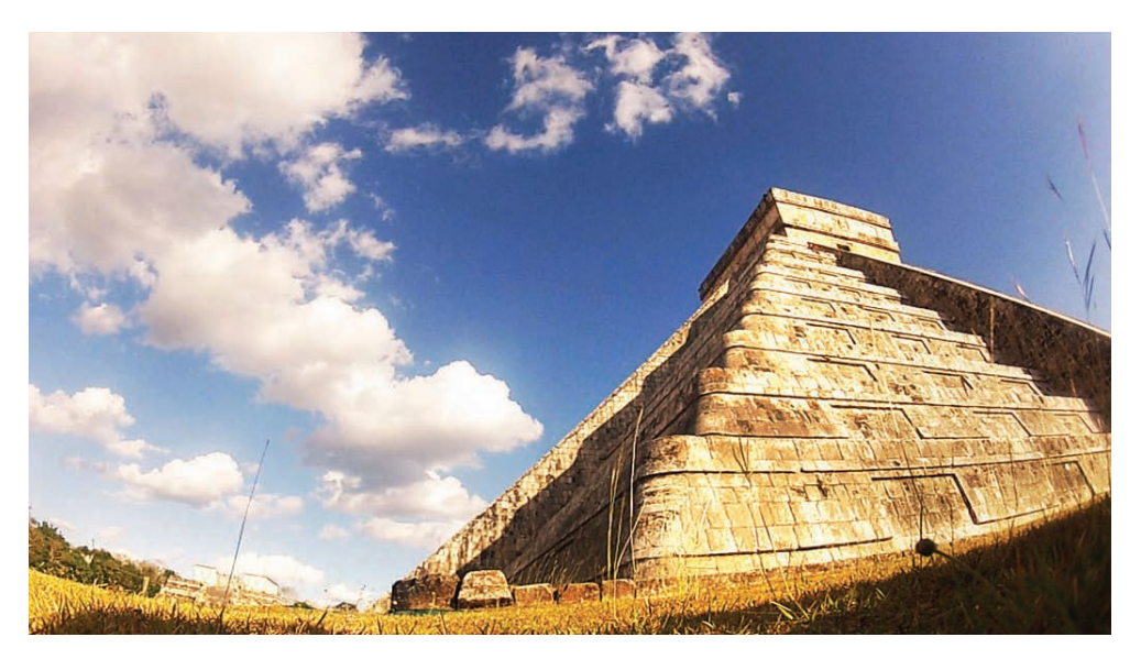
Time-lapse during the spring equinox at Chichén Itzá, Yucatan, Mexico