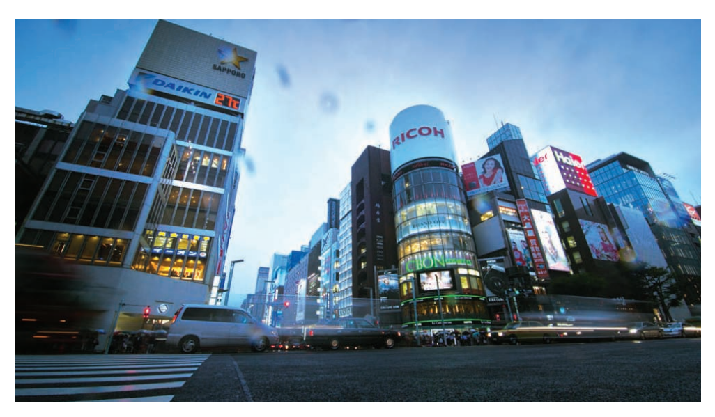
Time-lapse in Tokyo, Japan